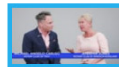
ROTARY_OI Rotary Zones