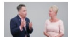
ROTARY_OI Rotary Zones